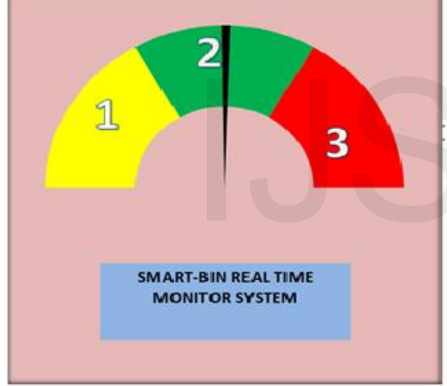
Fig. 3. Smart Bin Real-time Monitor System

The map of the city will be used in the application interface and these widgets marking the level of dustbin filled will be put in the location in map exactly the way dustbins are placed throughout the city. This will help the garbage analyzer to keep a track of dustbin filled in exact location. Thus our application will help the garbage analyzer to keep a check on every dustbin throughout city at real time. It will help him taking accurate decision and avoid the overflow of dustbins and use the resources more efficiently. These multiple smart bin model can be applied to any of the smart cities around the world. A waste collecting team which is deployed for collection of garbage from the city can be guided in a well manner for collection. The application will serve as a central application for the person responsible for monitoring the waste status across the city. The model interface in excel is made as shown below, it is completely dynamic in nature and is well connected with the